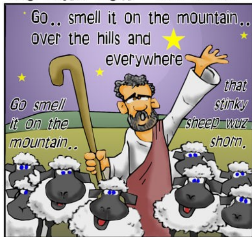
That old shepherd campfire song celebrating the life and smells of working with 'sheep' was revised to.. GO TELL IT ON THE MOUNTAIN shortly after the birth of the baby Jesus.